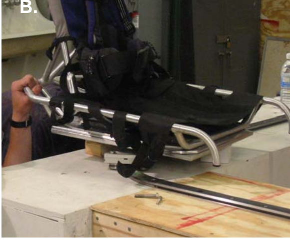
Figure 10.2. A. Seat Plate and Trolley Sliding along Curved Track Section. B. Seat Assembled to Trolley.